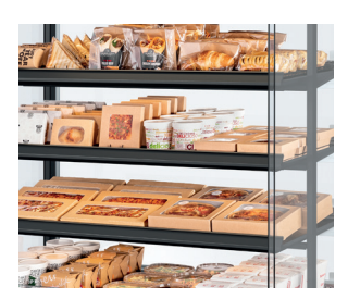
Ultimate product visibility transparent design, thin shelves, no distraction.