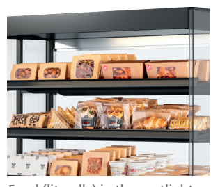
Food (literally) in the spotlights -LED lighting above each shelf.